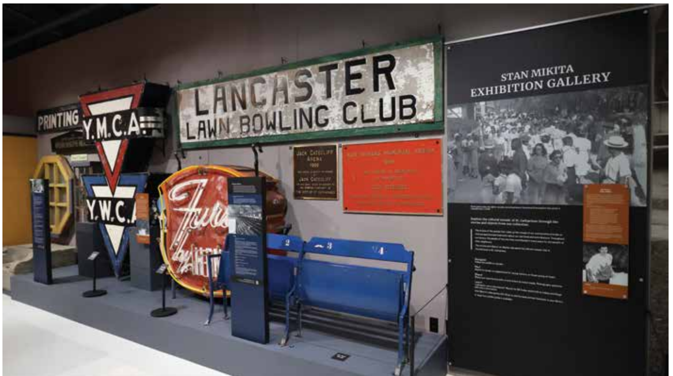
▲ The Stan Mikita Exhibition Gallery opened in January in the St. Catharines Museum and highlights recreation and leisure in the Garden City and how these have contributed to the distinct character of St. Catharines over time. PHOTO PROVIDED.