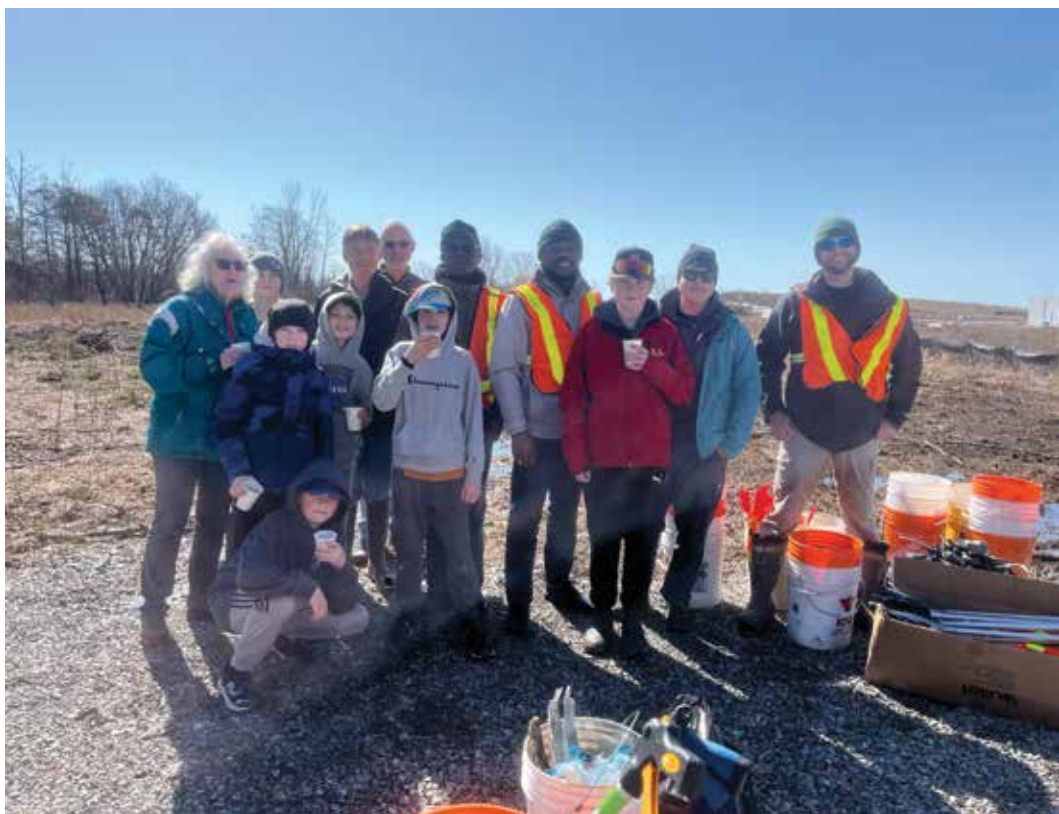
▲ Volunteers helped to clean up the shoreline at Lakewood Conservation Area in Niagara Region at the beginning of March. This initiative is part of a coastal wetland habitat and shoreline restoration project.